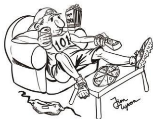
Going home if retired without reporting back to race control