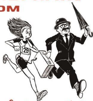
Running a race without a number or correct kit