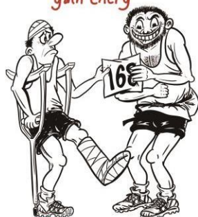
Running in another's number